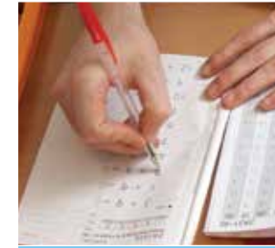
Hand in homework to assistants