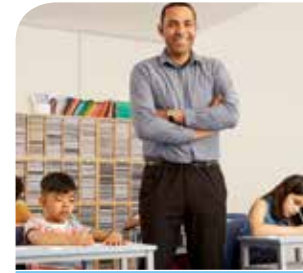
Arrival at class