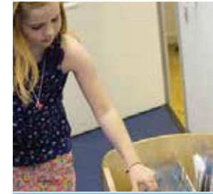
Collection of class folder